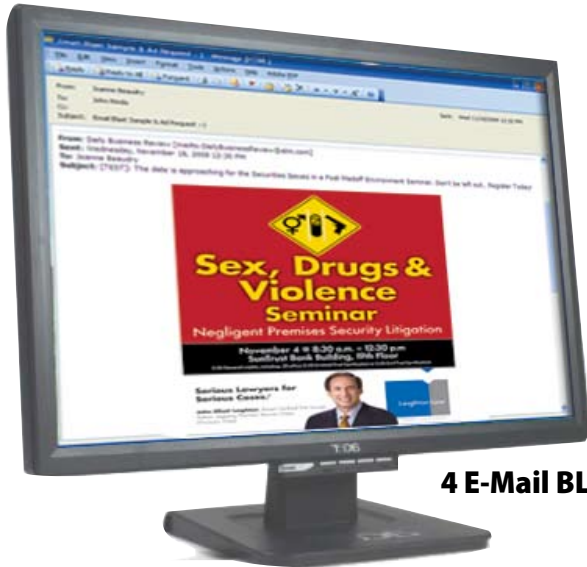
4 E-Mail BLASTS

Our in-house creative department can offer advice or create your digital ads to your specifications.